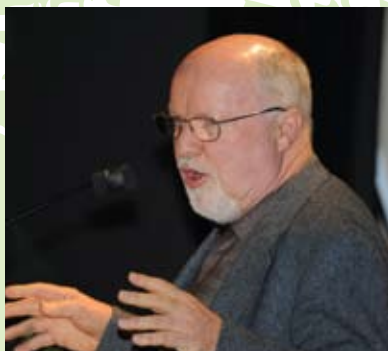
Fr. Richard Rohr discusses the important role of lay missionaries in transforming the world.