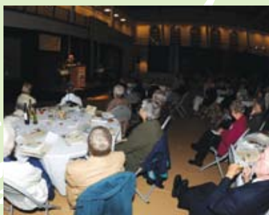
With over 400 guests in attendance, this is FMS's largest event to date.

To sum up the evening of October 23, 2010 in one word, it would have to be "joy." Amidst the echoes of the bamboo pan pipe and vocal styling of Andinay, the musical accompaniment of the evening, over 400 guests gathered to celebrate FMS's 20 years of presence, of serving in the Spirits of Saints Francis and Clare, and of caring for God's beloved.